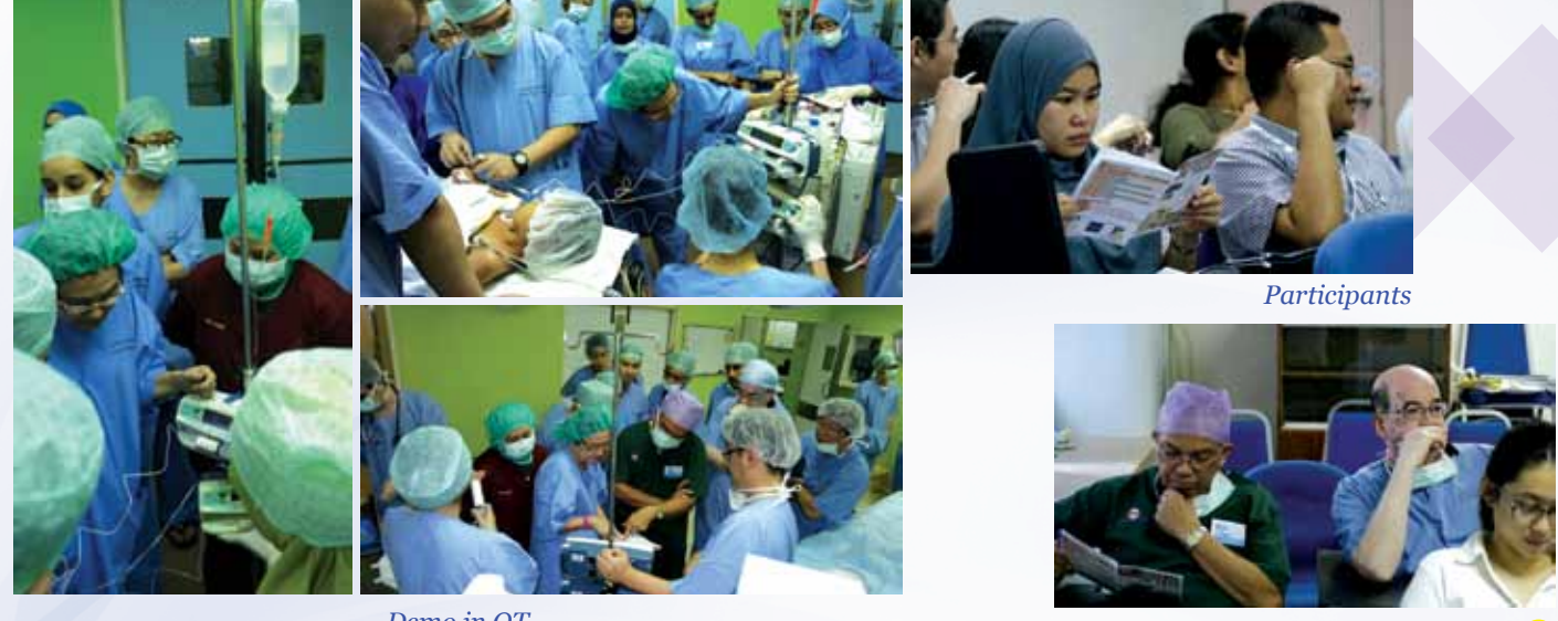
Demo in OT