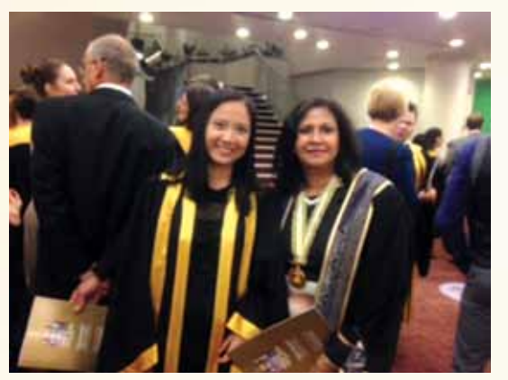
With an ANZCA fellow

The Annual Scientific Meeting, ANZCA 2018, will be held in the Kuala Lumpur Convention Centre in April. It will definitely be a meeting worth attending.