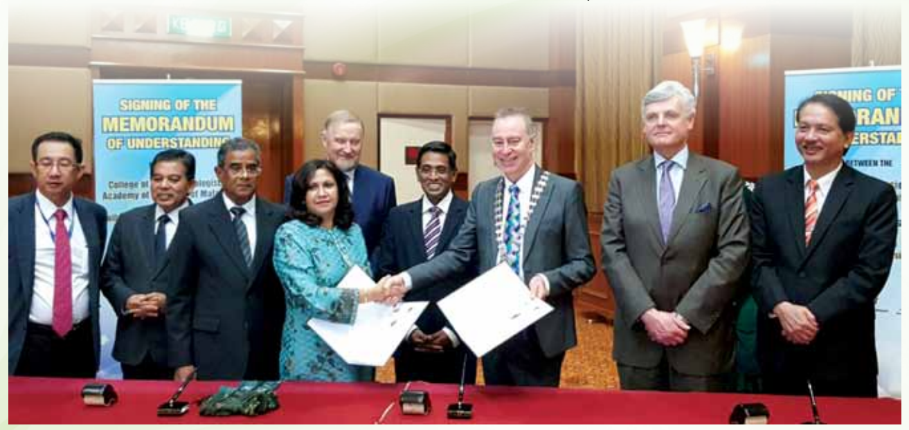
continued on page 10

In 2015, 391,150 anaesthetic procedures were performed in the public hospitals of which 57.51% were in emergency surgeries. In addition, there are 703 ICU beds and 186 high dependency beds available in the public hospitals with 40,793 admissions to the intensive care units. However, the country is still facing a shortage of anaesthesiologists with the current ratio of 1: 37,000 anaesthetic provider per population. The Ministry of Health is targeting a modest ratio of 1:30,000 by 2020.